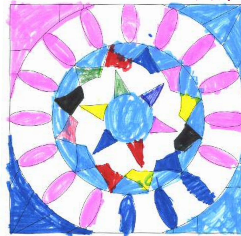
by Freya, age six

Some works of art from children at the cabin