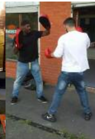
Anson youth project