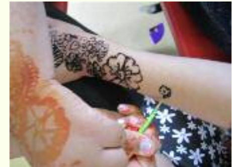
Henna Tattooing at the summer playscheme