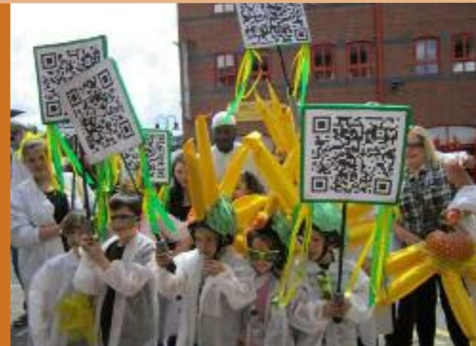
Anson Cabin Project taking part in Manchester Day Parade June 2012