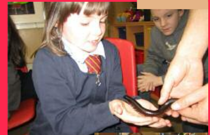
Meeting the animals at the cabin