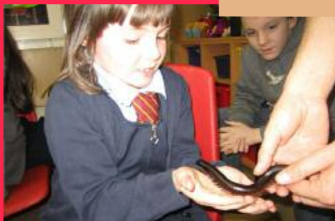
Meeting the animals at the cabin