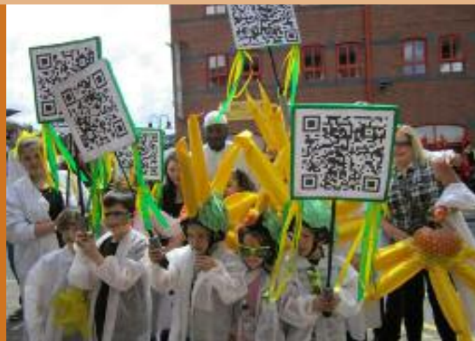
Anson Cabin Project taking part in Manchester Day Parade June 2012